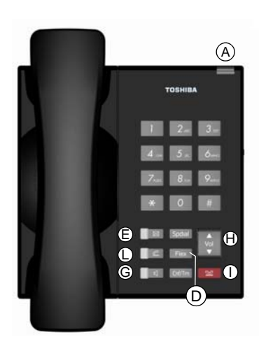
Single Line Telephone 1 Programmable Button