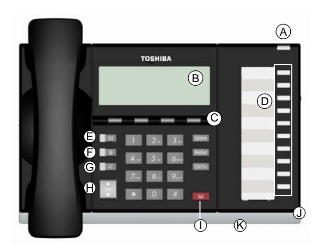
10 Programmable Feature Buttons 4-Line LCD